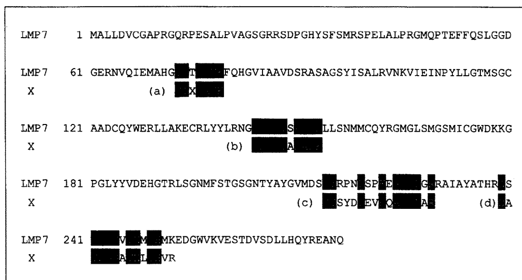
Fig. 2. Partial structural analysis of subunit X from human liver proteasomes. Sequence alignment of peptides derived from subunit X with those of human LMP7. Identical amino acid residues are boxed by black. Subunit X was digested with lysyl-endopeptidase (peptides a and b) or trypsin (peptides c and d) and the fragments separated by reverse-phase HPLC.

accord with the C-terminal sequence of the proteasomal subunit delta, as judged by a computer-assisted homology research. Subunit delta has been reported by DeMartino et al. [10] to be a unique proteasomal subunit, showing high similarity with LMP2, although its cDNA clone did not encode the full-length translational region. Moreover, we found that anti-delta monoclonal antibody reacted specifically with the spot Y on immunoblotting analysis after separation by 2D-PAGE. This anti-delta antibody did not react with LMP2 (Fig. 1B), despite the high sequence similarity of these two proteins (over 60% similarity). Thus we conclude that subunit Y is identical to delta and possibly related in function to LMP2.